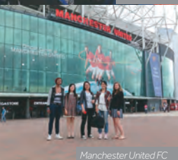
Manchester United FC