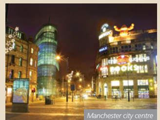
Manchester city centre