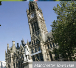
Manchester Town Hall

For enquiries, please e-mail: International.SummerSchool@manchester.ac.uk