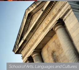
School of Arts, Languages and Cultures